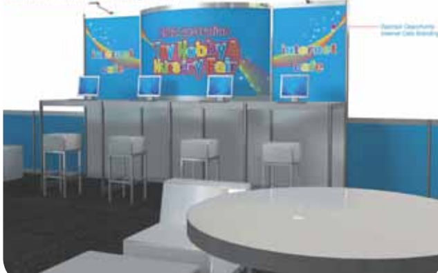
Internet Lounge & Stage Area