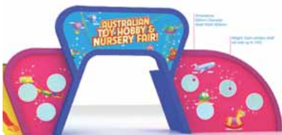
Entrance Arch Sponsor Product Display