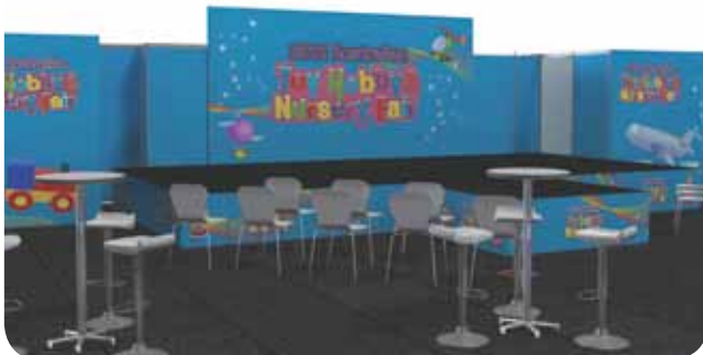
Internet Lounge & Stage Area