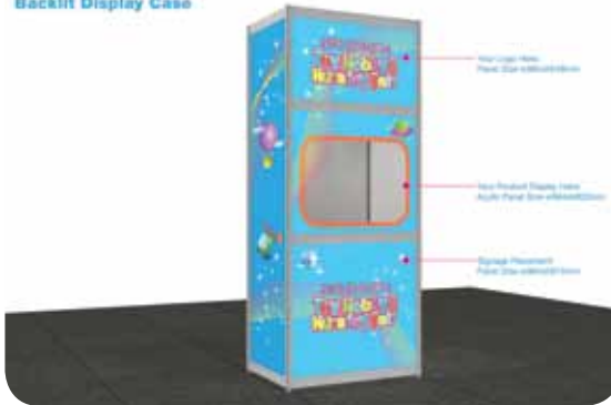
Backlit Display Case